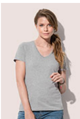
ST2700 Classic-T V-neck